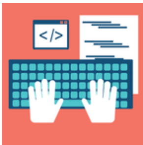
How does Google work?