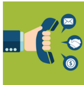
Off Page Optimization